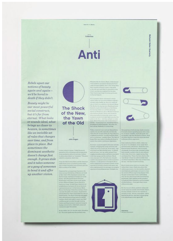
Example of layouts and typefaces that matches the tone of the website